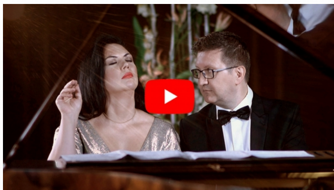
TALES OF LOVE